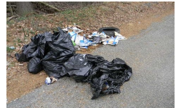
Household garbage dumped illegally on the side of a road.

This pamphlet and the information contained herein shall not constitute legal advice and should not be relied upon in lieu of consultation with the appropriate legal advisors. In addition, the contents of this pamphlet are not intended to supersede, abridge or alter the regulations set forth by the New Jersey Department of Environmental Protection (NJDEP).