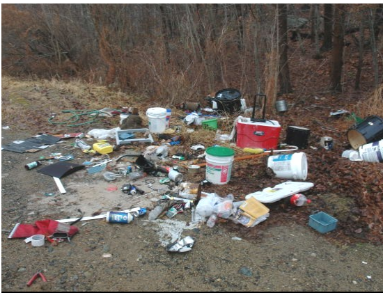
Construction contractor's garbage illegally dumped in a state park.