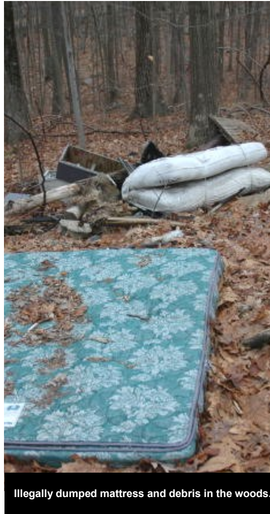
Illegally dumped mattress and debris in the woods.